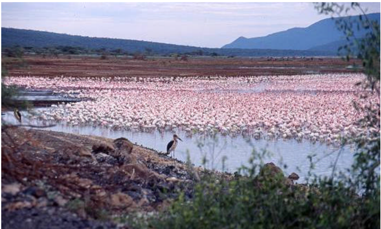
Flamingos at Lake Nakuru, Kenya.

In addition to achieving the main objective of the workshop, several talks were given on various interesting issues relating to Lesser Flamingos, which included current work being carried out on algae toxins in Kenya and their affect on flamingo health, detailed work on the presence and affects of heavy metal poisons in Lesser Flamingos, and the conception, planning and recent construction of a flamingo breeding island on Kamfers Dam in South Africa. Delegates were also treated to a very pleasant trip to Lake Nakuru that, on occasions, held a large proportion of the continent's population (>1 million birds).