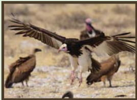
White - headed vulture